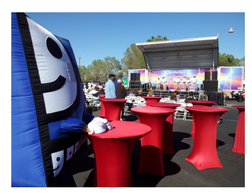
December 2012: Festival of Lights Mobile Store Goodwill expanded our presence at this annual event by having not only a Mobile Christmas store, but a "Smiley G" photo area and information booth.