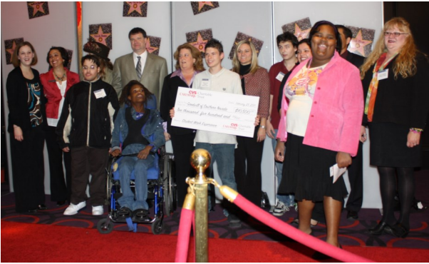
February 2011: Goodwill's annual Community Recognition Luncheon honors clients and community partners.