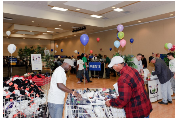
March 2011: US Vets Las Vegas Stand Down Goodwill participated in the U.S. Vets Stand Down by hosting a voucher-only mobile store providing homeless vets with attire both casual & career oriented. Goodwill Career Connections had a table offering career services as well.