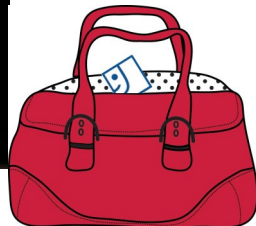
The job is in the bag! GOODWILL OF SOUTHERN NEVADA