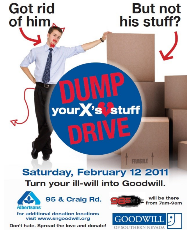
February 2011: Dump Your Ex's Stuff—Goodwill held a fun, tongue-in-cheek donation drive. A radio remote was held at an Albertsons donation site.